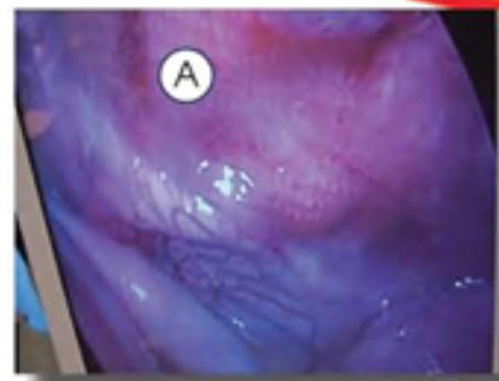
Laparoscopic view of hernia mesh (A) 14 days post fixation by LIQUIBAND® FIX8™ revealing advanced stage of fibrosis and tissue integration

In a pre-clinical evaluation in a porcine model, no migration of polypropylene mesh (PROLENE®) was observed fourteen days post fixation by LIQUIBAND® FIX8™ with a high peel force required to detach the mesh from adhered tissues. Gross examination and histological analysis confirmed no adverse inflammatory response to the adhesive and also demonstrated a normal process of fibrosis and integration of the mesh into surrounding tissues. 3